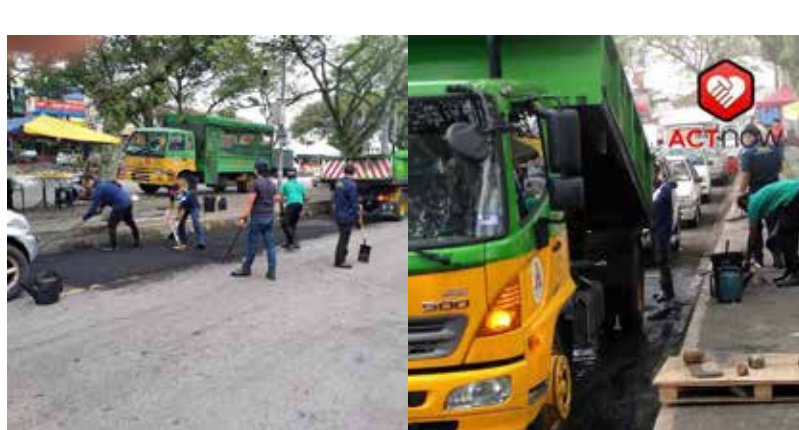
DBKL in the progress of fixing potholes

ACTnow has come across a brief conversation with one of the local councils to understand that it takes a multiple level of approvals especially in terms of financial allocation, before proceeding towards planning, investigating, scheduling, engaging contractors and completing the work. Furthermore, the scheduling will then depend on the severity of potholes amongst the reports received. Hence, the period of resolving the issue may vary. This is also why the Works Ministry has specially mentioned the time taken to resolve a pothole issue will vary depending on the size of the potholes. If it is 200mm or below, the filling of potholes will take within 24 hours. ACTnow would like to thank all the relevant parties for working hard and making it possible for us to take a step closer towards Zero-Potholes Policy.