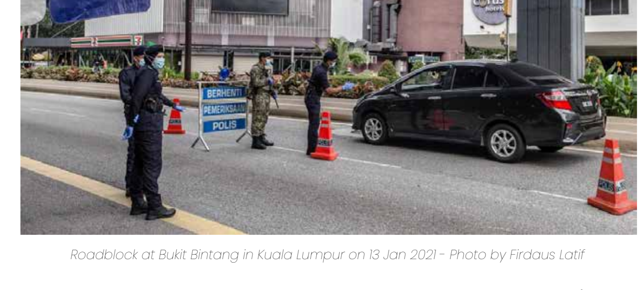
On 2 February 2021, Senior Minister for Security and Minister of Defence, Dato' Sri Ismail Sabri bin Yaakob urged the public to report any SOP violators to help contain the spread

Extension of MCO 2.0 has been announced until 18 February with stricter SOPs due to