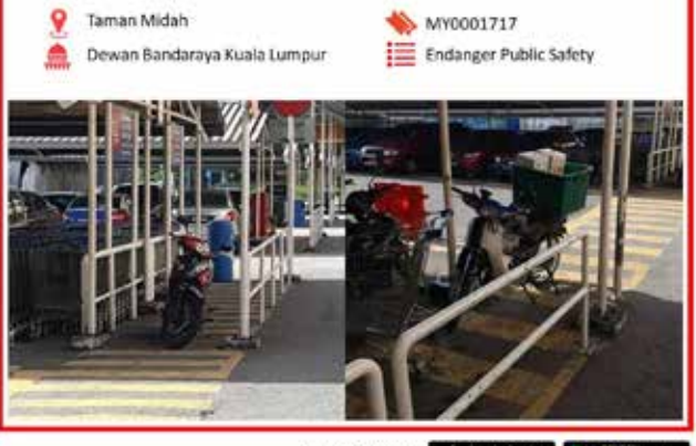
Available on : App Store Scoole Play