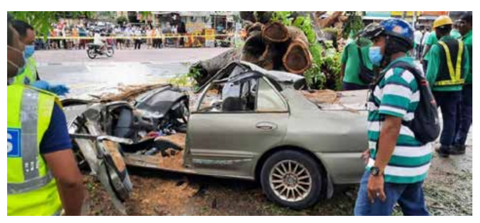
Condition of the car after the accident

Official age to obtain a motorbike license is 16-year-old, which means some or maybe all of the suspects were driving without license and definitely do not own the motorcycles. Parents at home should not allow their teen children to ride their motorcycles to prevent these dangerous acts from happening. It is lucky when they return home safely, however if any accidents were bound to happen, then parents will lose their children forever.