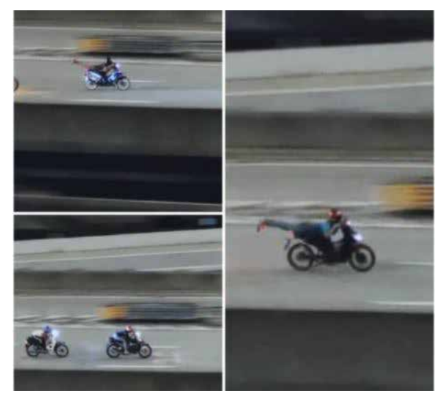
Mat Rempit footages

APRIL 24, KUALA LUMPUR - During the operation of Ops Samseng Jalanan by Kuala Lumpur Traffic and Investigation Department (JSPT KL), conducted on Akleh Highway in Ampang from IAM to 4.30AM, five Mat Rempit were arrested after being caught performing dangerous acts on the road. All of the suspects are under the age of 18 and two of them were just 15-year-old.