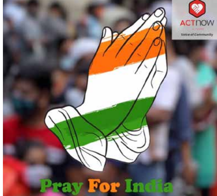
Pray for India by ACTnow : Watch here Show your support by sharing this video and pray

If the healthcare system breaks down, we may go through the same situation as India at the moment.